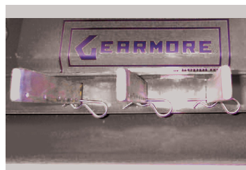
Units available with rake teeth