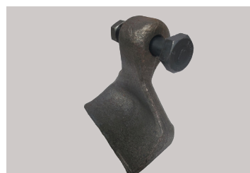
Hammer knife shreds up to 2" brush