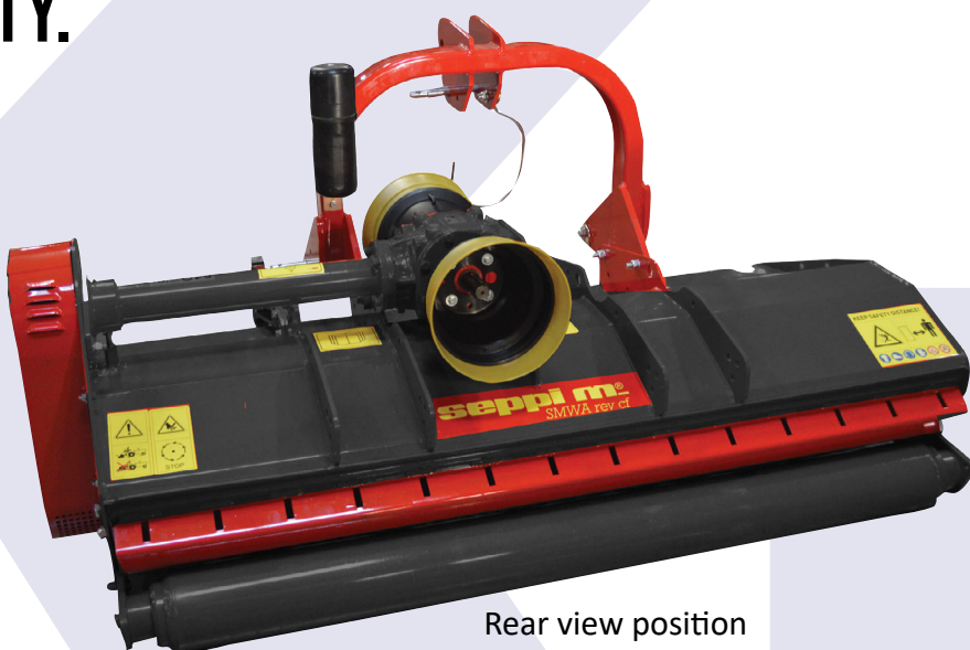
Rear view position

Our "GCF" Series Mower/Shredders are now designed for front or rear tractor mount. To front mount, just rebolt the A-frame to the back of the shredder. Equipped with a rear deflector which in open position discharges grass and allows tractor speeds up to 6 M.P.H., and in closed position contains and further shreds brush to a finer mulch. Just right for use in vineyards, berries and other narrow row crops. Also used by roadsides, parks, rental yards, and general weed abatement.